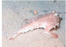
Ogcocephalus cf. declivirostris Slantbrow batfish