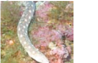
Myrichthys breviceps Sharptail eel

All photographs were taken using a camera on the NTRC/UNCW remotely operated vehicle at depths between 50 and 150m, unless credited to Joyce and Frank Burek.