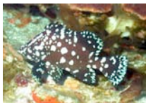
Dermatolepis inermis Marbled grouper (juvenile)