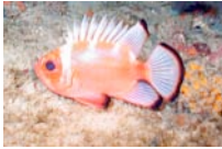
Pristigenys alta Short bigeye