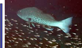
Mycteroperca microlepis Gag