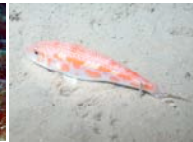
Upeneus parvus Dwarf goatfish