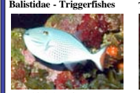
Xanthichthys ringens Sargassum triggerfish