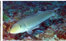
Malacanthus plumieri Sand tilefish