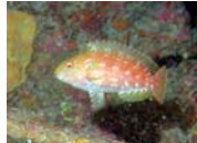
Sparisoma atomarium Greenblotch parrotfish