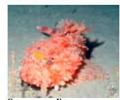
Scorpaena dispar Hunchback scorpionfish