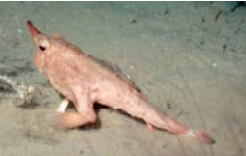
Ogcocephalus cf. nasutus Shortnose batfish