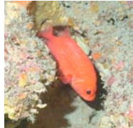
Corniger spinosus Spinycheek soldierfish