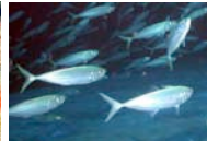
Selar crumenophthalmus Bigeye scad