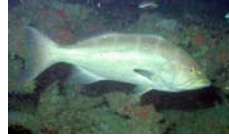
Mycteroperca interstitialis Yellowmouth grouper