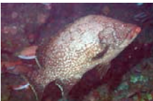
Dermatolepis inermis Marbled grouper