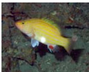
Gonioplectrus hispanus Spanish flag