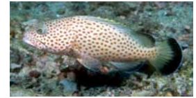
Epinephelus guttatus Red hind