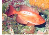
Priacanthus arenatus Bigeye