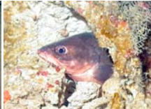
Brotula barbata Bearded brotula