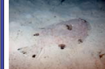
Cyclopsetta chittendeni Mexican flounder