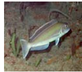
Caulolatilus chrysopterus Goldface tilefish