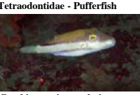
Canthigaster jamestyeri Goldface toby