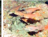
Apogon affinis Bigtooth cardinalfish