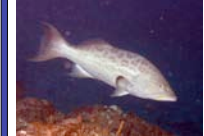
Mycteroperca phenax Scamp