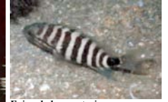
Epinephelus mystacinus Misty grouper