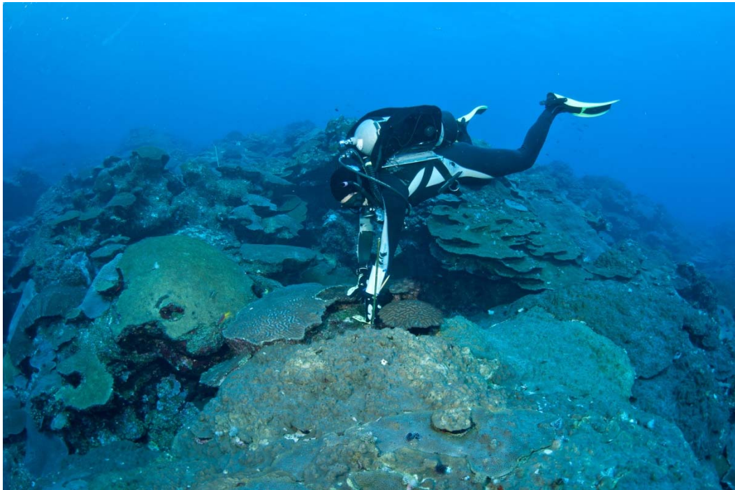
A diver attaches a new tag to a monitoring pin at East Flower Garden Bank.

FGBNMS will continue to sponsor and/or conduct the long-term monitoring efforts at East and West Flower Garden and Stetson Banks. Long-term monitoring of East and West Flower Garden Banks has been conducted since 1988 through contracting and in partnership with MMS (which became BOEM in 2011). Sanctuary staff assumed responsibility for the Flower Garden Banks long-term monitoring project in 2009 through a combination of ONMS and MMS support. Sanctuary staff have conducted the long-term monitoring program at Stetson Bank since 1998. The sanctuary research team maintains a database of the monitoring data, including historical records and non-digitized collections.