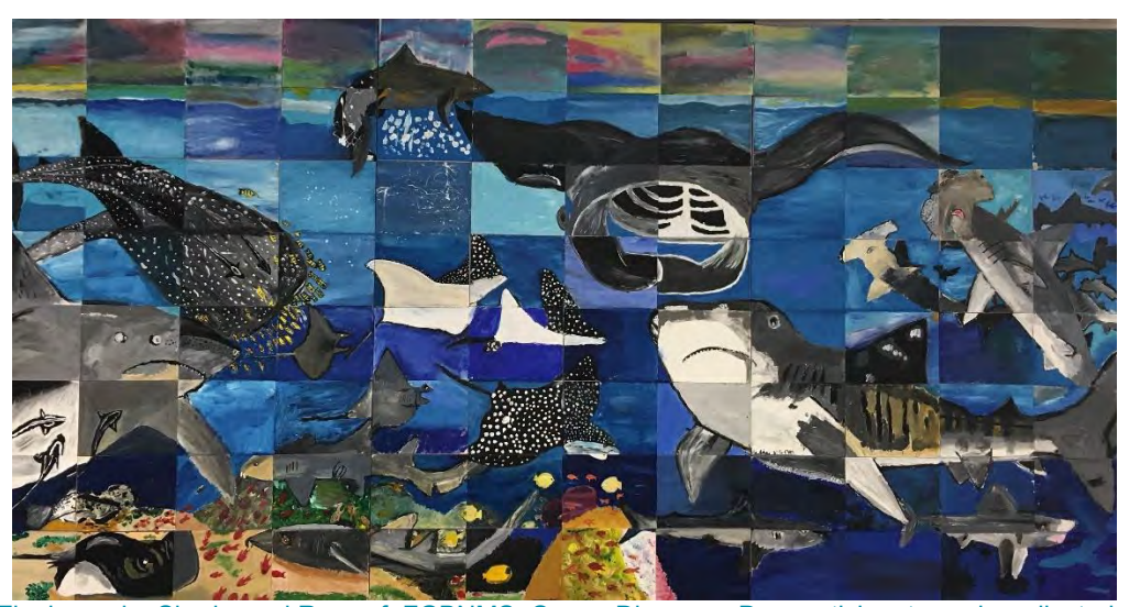
2017 Final mural – Sharks and Rays of FGBNMS. Ocean Discovery Day participants each replicated a portion of the original mural on an 8.5x11" canvas. A total of 96 individuals, mostly children, contributed a section to create this 12'x6' mural.