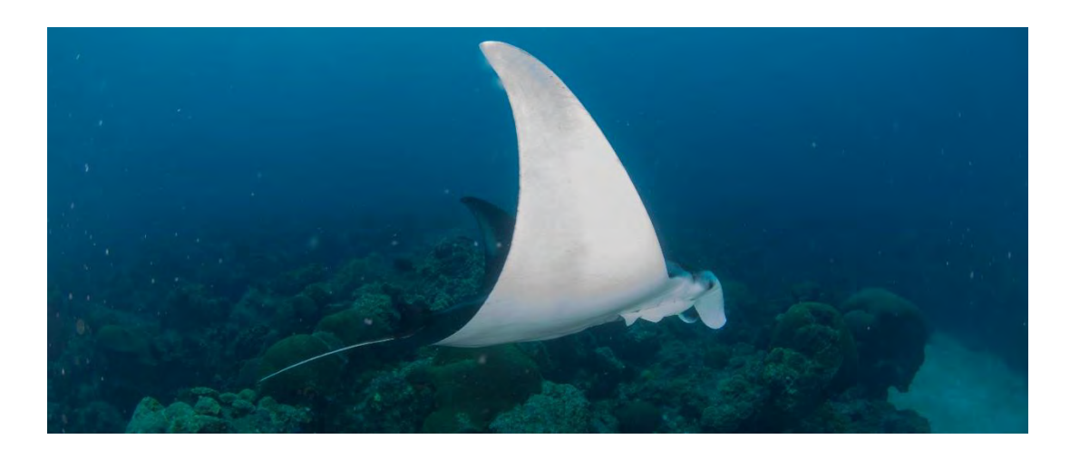
Manta Ray swimming over the coral reef at FGBNMS.