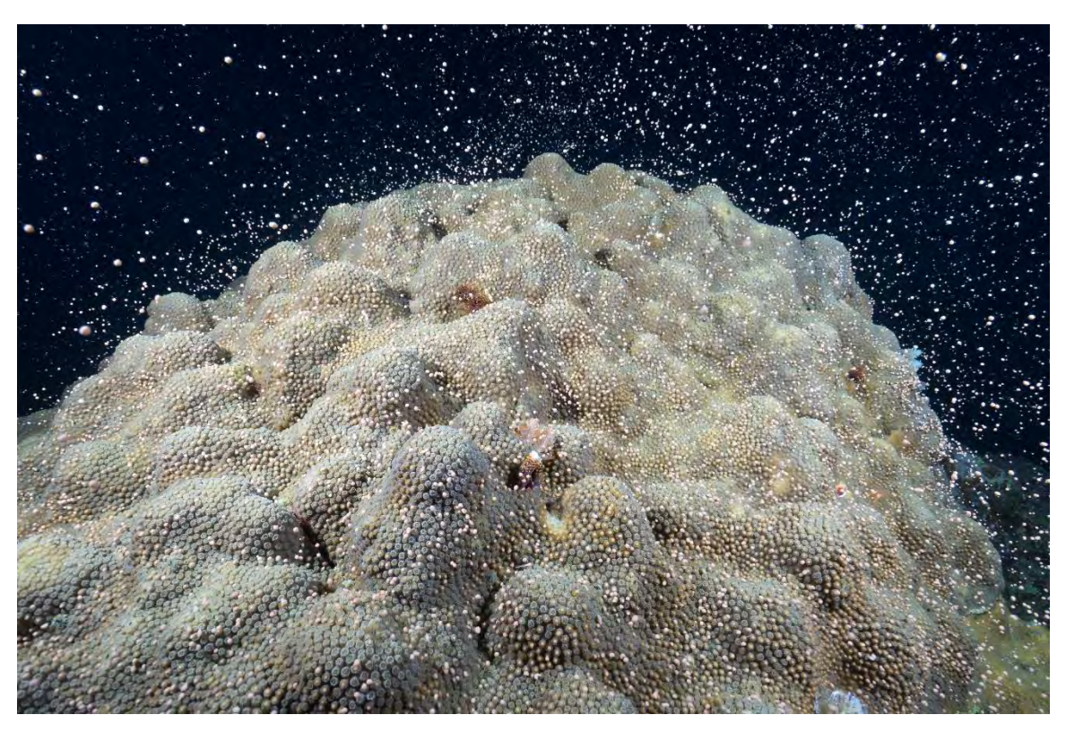
Orbicella faveolata, a star coral, releases gamete bundles during the annual mass spawning event.