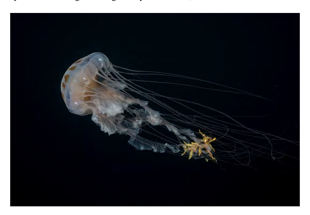
Atlantic Sea Nettle (Chrysaora quinquecirrha) at Stetson Bank.